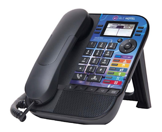
8019s DeskPhone with customized faceplate